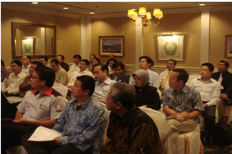
At the lecturing session