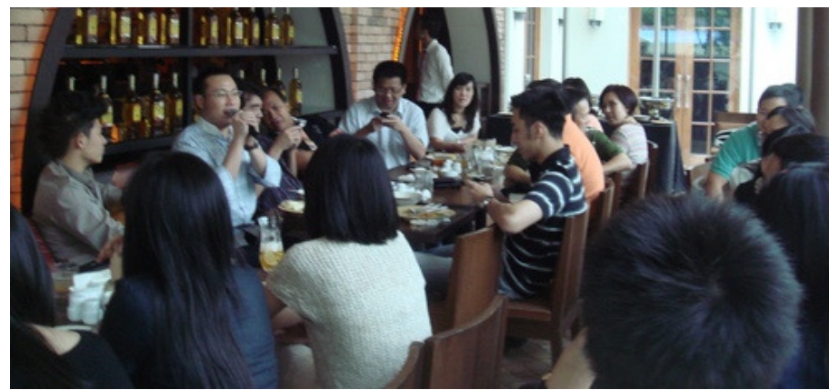
Cheesee... See you next year... till then.... FIGHT ON!